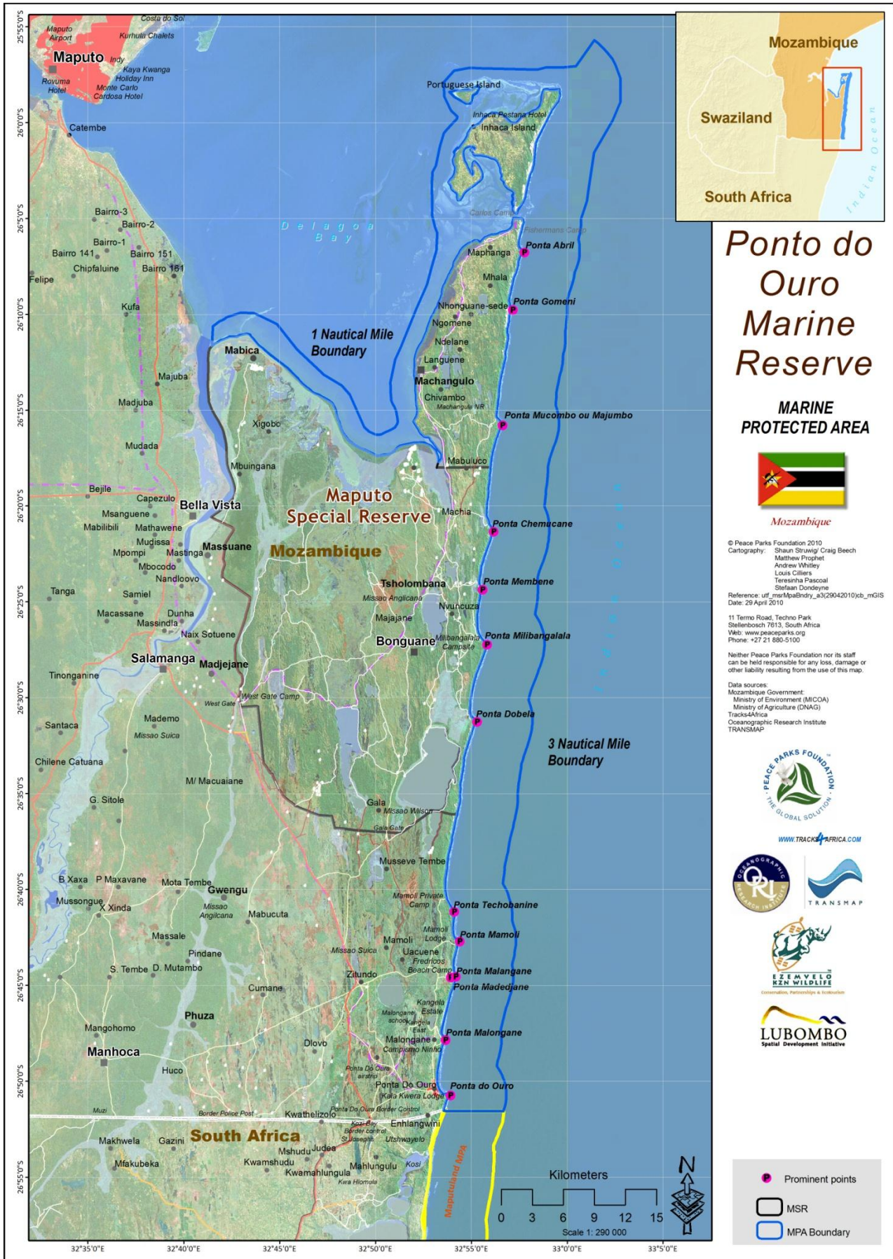
Map 1: Ponta do Ouro Partial Marine Reserve